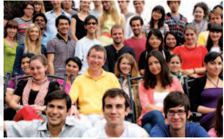
Have a good time at the Sommerhochschule

Students from all over the world have been drawn to the program, not only because of the outstanding academic reputation of its European Studies courses and the excellent opportunities it offers students to learn German, but also because of its location directly on the shores of one of Austria's most scenic lakes, Lake Wolfgang, in the Salzkammergut region, and because of the area's excellent sports and recreational facilities .