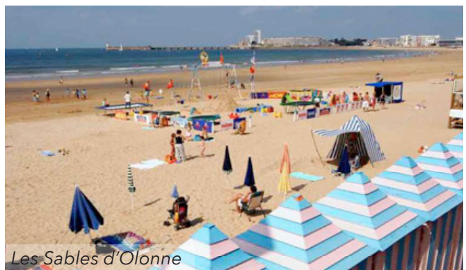
Les Sables d'Olonne